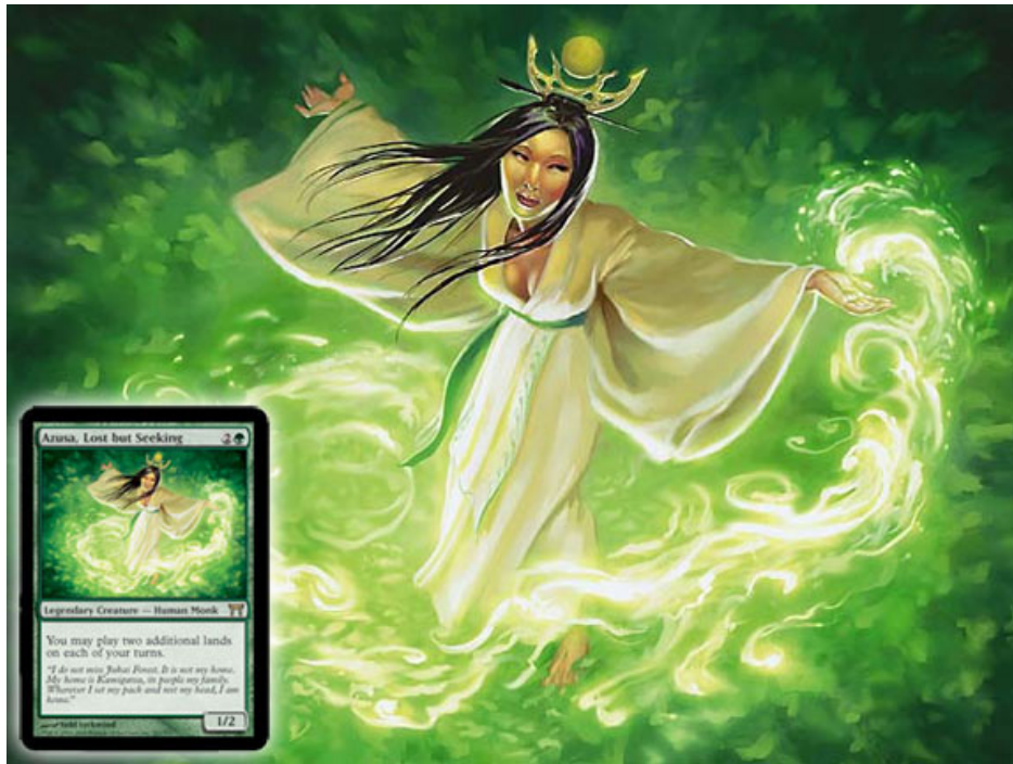
Azusa, Lost but Seeking art by Todd Lockwood

This is the green-aligned priestess mentioned in the art description: the amazing Azusa, Lost but Seeking by Todd Lockwood. It seems likely we have a green card on our hands, and possibly a spell effect.