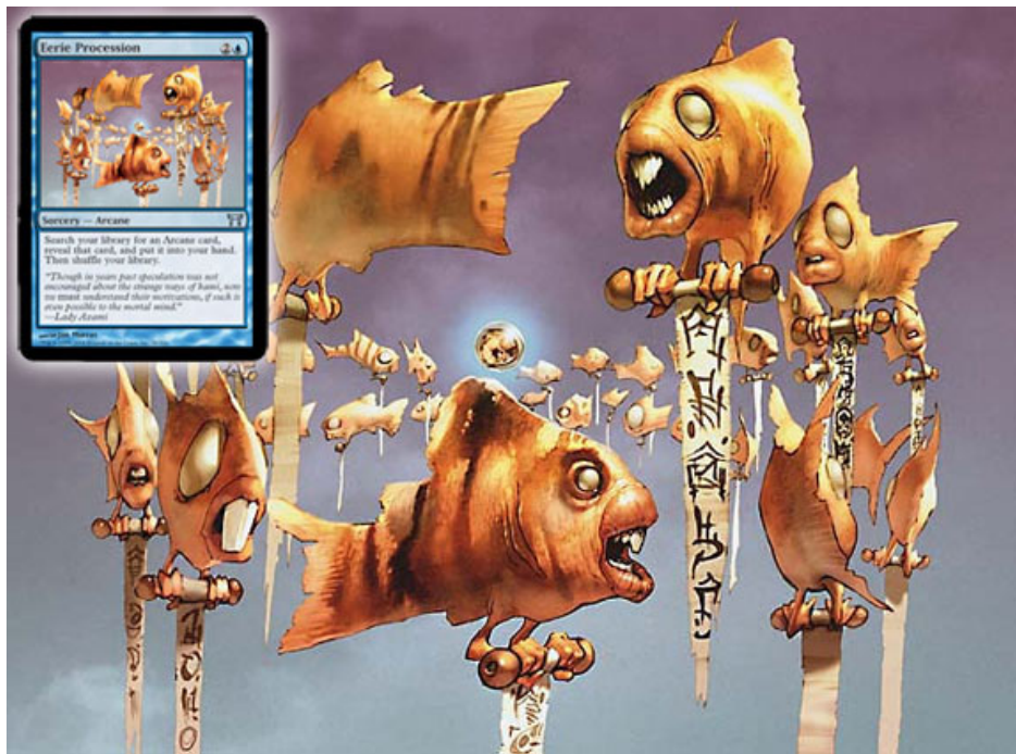
Eerie Procession art by Jim Murray

This is the last piece referred to in the description -- Eerie Procession also by Jim Murray. These fishlike spirits march around in an incomprehensible mystical ceremony, tutoring up an Arcane spell for the caster.