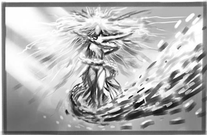
Sketch by Greg Staples

The initial sketch, created by Magic art workhorse Greg Staples , gives a sense of the kinetic energy of the final piece, but not enough detail to recognize the other cards mentioned in the art description.